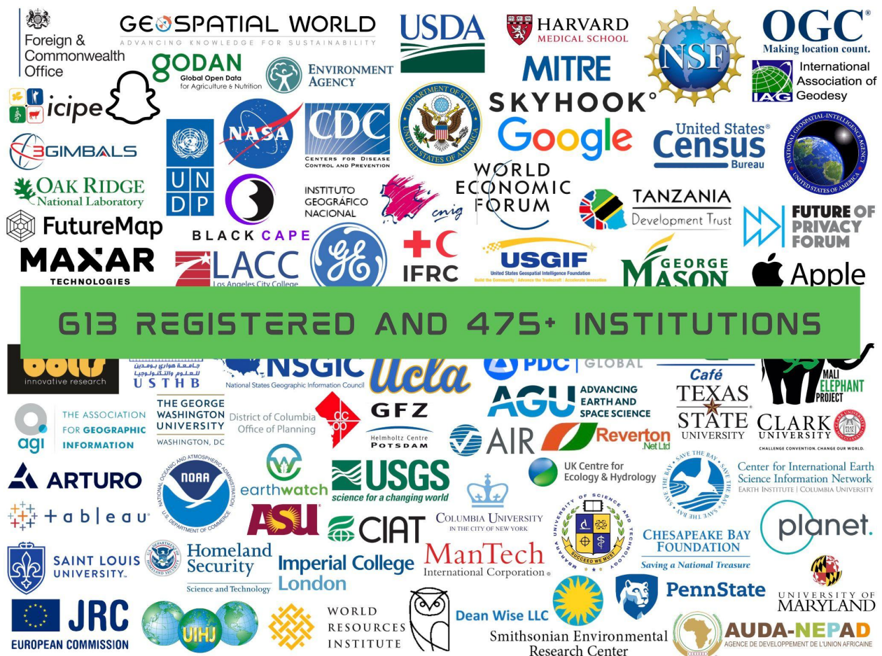
Figure 1: Selected organization of participants

Overall, 613 individuals representing more than 500 unique organizations registered to attend the three-day conference (see figure 1 below). The majority, 48%, represented the education/academia sector. Participants from governmental agencies comprised 18.5%, industry 16.8%, nonprofits 8.7% and others including foundations 7.9% (see figure 2 below).