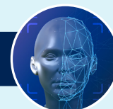
AI AND SOCIETY

To learn more about NSF’s AI initiatives, please visit new.nsf.gov/focus-areas/artificial-intelligence .