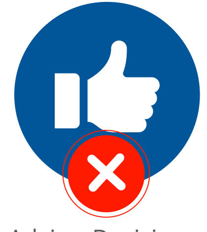
Advice, Decisions, Investigations, Policy