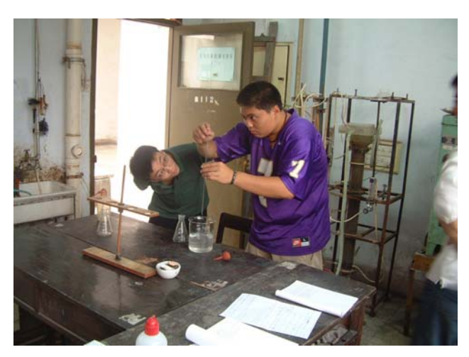
Partnerships for Innovation Program, University of Washington,