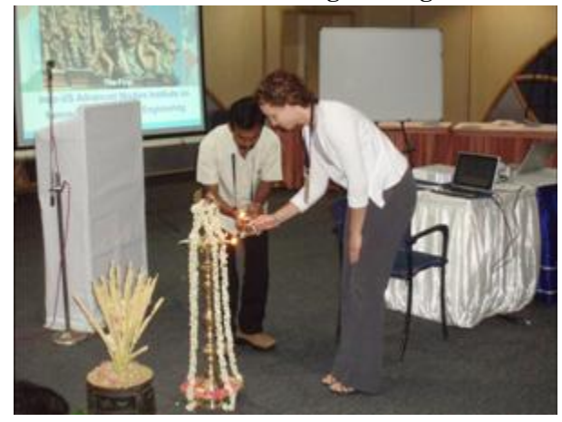
Inauguration Ceremony for Nanoscale Advanced Studies Institute.

Senior researchers delivered state-of-the-art lectures covering scientific, technological, educational and societal aspects of nanoscience and engineering. According to first reports, the institute stimulated student interest in nanoscale science and engineering and strengthened connections between U.S. and Indian scientific communities. The 27 U.S. participants included advanced graduate students, postdoctoral researchers, early-CAREER faculty and industry researchers. Holding this Advanced Studies Institute in Chennai was a first for India.