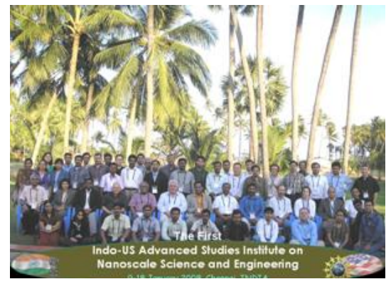
Participants at the First U.S.-India Nanoscale Advanced Studies Institute.

U.S.-India Advanced Studies Institute in Nanoscale Science and Engineering in Chennai, India, enabled advanced graduate students and world-class researchers from both countries to meet about fundamental topics and cutting-edge developments in nanoscale science and engineering disciplines. The panel discussions ranged across physics, chemistry, materials engineering, chemical engineering, and economics. They included policy perspectives from academia, government and industry representatives.