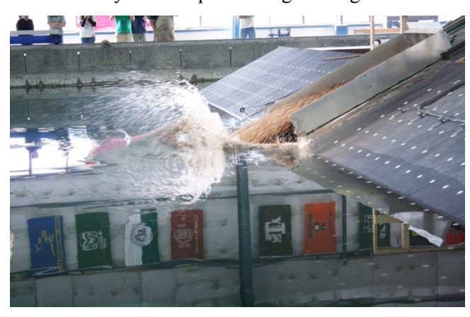
Using a unique landslide tsunami generator, researchers at the Georgia Institute of Technology in cooperation with faculty at University of Alaska at Fairbanks are investigating a methodology for improved assessment and mitigation of landslide and tsunami hazards. Field data from landslide-generated tsunamis events are limited to very few cases with marginal data that are generally missing the most important information related to tsunami generation characteristics. Researchers are compensating for this lack of field data by creating physical models of three-dimensional tsunami generation by deformable landslides and source run-up in the NEES Tsunami Wave Basin at Oregon State University.

and engineering firms engaging in NEES research or using data and models developed through NEES. NEES leverages complements its capabilities through connections and collaborations with large testing facilities at foreign earthquake-related centers, laboratories, and institutions. NSF has developed a partnership to utilize the NEES infrastructure with the 3-D Full-Scale Earthquake Testing Shake Table Facility (E-Defense), located in Miki City, Japan, and built by the Japanese National Research Institute for Earth Science and Disaster Prevention (NIED), which became operational in 2005. To facilitate NEES/E-Defense collaboration, in September 2005 NSF and the Japanese Ministry of Education, Culture, Sports, Science, and Technology signed a Memorandum Concerning Cooperation in the Area of Disaster Prevention Research. In August 2011, two NSFsupported research projects used a full-scale, five-story steel frame structure at the E-Defense facility to test new seismic base isolation concepts and the response of non-structural