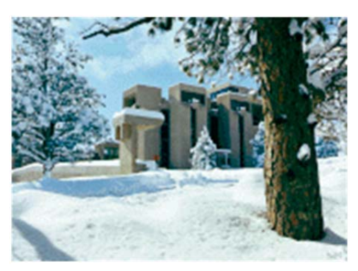
The Mesa Laboratory, designed by architect I.M. Pei, in Boulder, CO. Credit: NCAR .

As of January 2014, NCAR supported a total of 803.5 full time equivalents (FTEs), of which 363.8 are funded under the NSF primary award to UCAR.