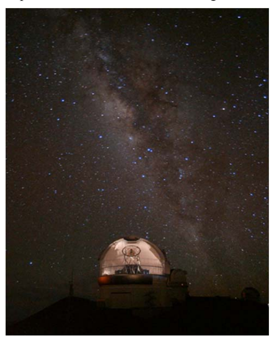
Night at the Gemini North telescope on Mauna Kea, Hawaii. The transparent-dome effect is created by the stacking of many images obtained throughout a night of observing. The central regions of our Milky Way galaxy seen against an incredibly dark sky provide a stunning backdrop to the telescope.

Among the fundamental questions being investigated by today's astronomers are the age and rate of expansion of the universe, the origin of the "dark energy" that is manifested in the cosmic acceleration,