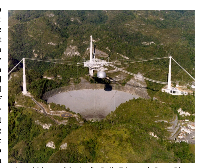
An aerial image of the Arecibo Radio Telescope in Puerto Rico. The platform suspension structure, including the Gregorian dome that houses the main suite of research instruments, is visible over the 305-meter primary reflector dish below.

Partnerships and Other Funding Sources: Arecibo leverages NSF support with funding from other federal and non-federal sources. Since FY 2010, the NASA Near Earth Object Observation Program has committed $2.0 million annually to Arecibo in support of the planetary radar program; this was increased to $3.60 million for FY 2013, with more observing time allocated to the NASA Program. NASA support is expected to continue, subject to the availability of appropriated funds. In FY 2010, observatory management finalized an assistance agreement with the Puerto Rico Infrastructure Financing Authority to receive $3.0 million for one-time major infrastructure improvements at Arecibo Observatory. A grant to the Visitor Center from the Puerto Rico Department of Education was finalized in 2013; this award for $1.90 million over 7 months will enable large numbers of Puerto Rican school children to visit the site. Extensions of the award are being pursued.