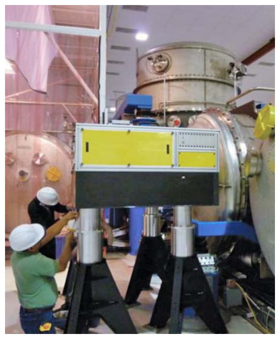
Installation of a quantum-mechanical squeezing experiment at LIGO in 2011. The temporary experiment allowed LIGO to increase its sensitivity by more than 20 percent over most of its frequency range. Such research is conducted by LIGO Laboratory and the LIGO Scientific Collaboration to reduce risk in the Advanced LIGO construction project.

For more information on AdvLIGO, see the MREFC chapter.