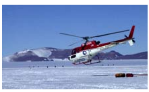
Helicopters provide support to field parties in the McMurdo Dry Valleys in southern Victoria Land and at remote field camps.

• NSF Structure: PLR staff, including subject matter experts in operational and scientific disciplines, have overall responsibility for funding and managing Polar Facilities under the USAP that NSF budgets for and manages on behalf of the Nation. This includes planning all activities and overseeing contractors. PLR's Antarctic Sciences section funds merit-reviewed research proposals for which access to Antarctica is essential to advancing the scientific frontiers and that can only be achieved or are best achieved with research work in Antarctica and the Southern Ocean. Research is conducted in a broad array of geo- and bio- sciences, including earth system science, as well as space and