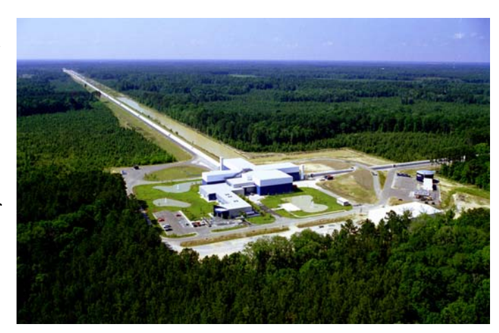
An aerial view of the Livingston, LA LIGO site.

In April 2008 construction began on the Advanced LIGO (AdvLIGO) Major Research Equipment Facility and Construction (MREFC) project, which is designed to increase the sensitivity of LIGO tenfold. AdvLIGO is being built within the existing LIGO laboratory. LIGO's current and projected operations and maintenance expenses are designed to sustain operation of the LIGO laboratory while construction is underway, as well as to commission and operate the upgraded apparatus following the completion of construction in 2015. These include support for basic infrastructure costs not directly related to the AdvLIGO construction project, analysis and