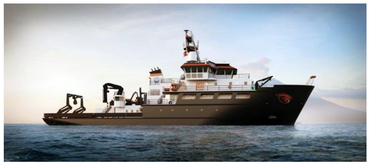
Artist's rendition of the RCRV as constructed.

the use of the U.S. Academic Research Fleet, which suggests RCRV is likely to cost NSF approximately $4.30 million in FY 2022, which is the first year the lead ship transitions into full operations in the ARF. A solicitation for operations of additional vessels beyond the first RCRV operated by OSU was released in January 2018.