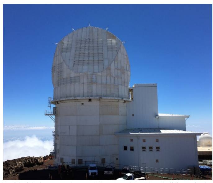
The DKIST telescope enclosure and Support and Operations building at the site on Haleakalā, Maui, HI.

The unexpected length of the delay associated with the environmental compliance process led to a reassessment of the project schedule and total project cost in 2012. An external