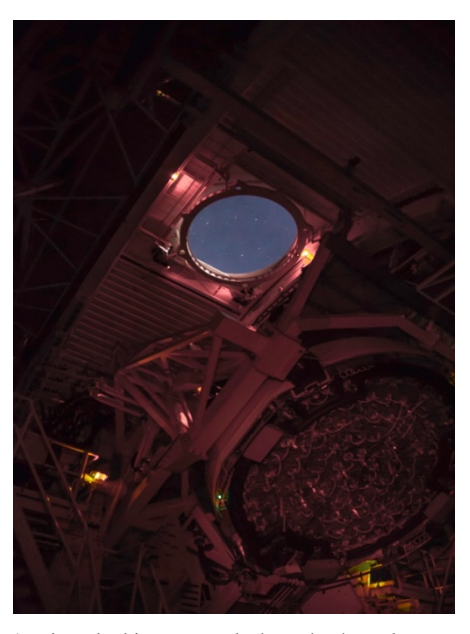
enclosure entrance aperture during the first evening of on-sky tracking and pointing tests of DKIST.

Project management control, interface control, and change A view looking upward through the telescope controls are in place. The project also maintains a risk register that is reviewed and updated monthly.