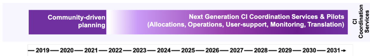
Figure 2. Notional execution timeline for the national CI coordination services blueprint.

CI coordination services (contingent as always on budgets and national priorities) over the lifetimes of the NSF-funded computational ecosystem to ensure its effective and efficient use.