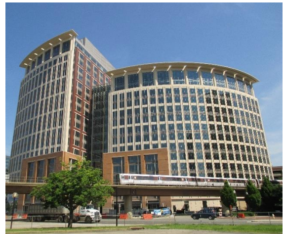
National Science Foundation Headquarters.

NSF is committed to evaluating the efficacy and efficiency of its strategy, leveraging evaluation to help the agency achieve its mission.