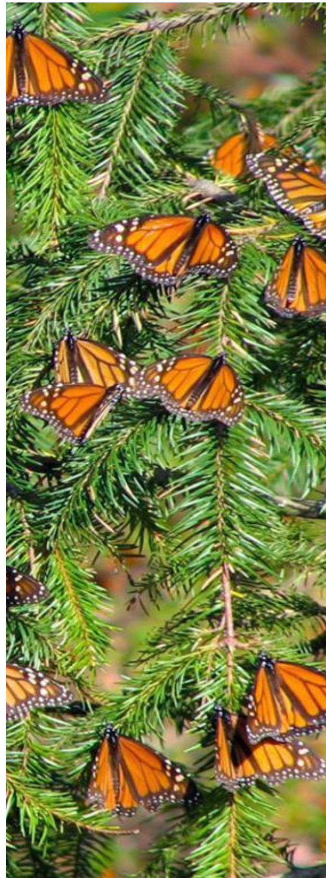
Monarch butterflies basking in the sun.

NSF evaluators and collaborators shall follow NSF procedures to identify and prevent conflicts of interest, and engage in peer review and quality control processes at appropriate stages of the life cycle of an evaluation.