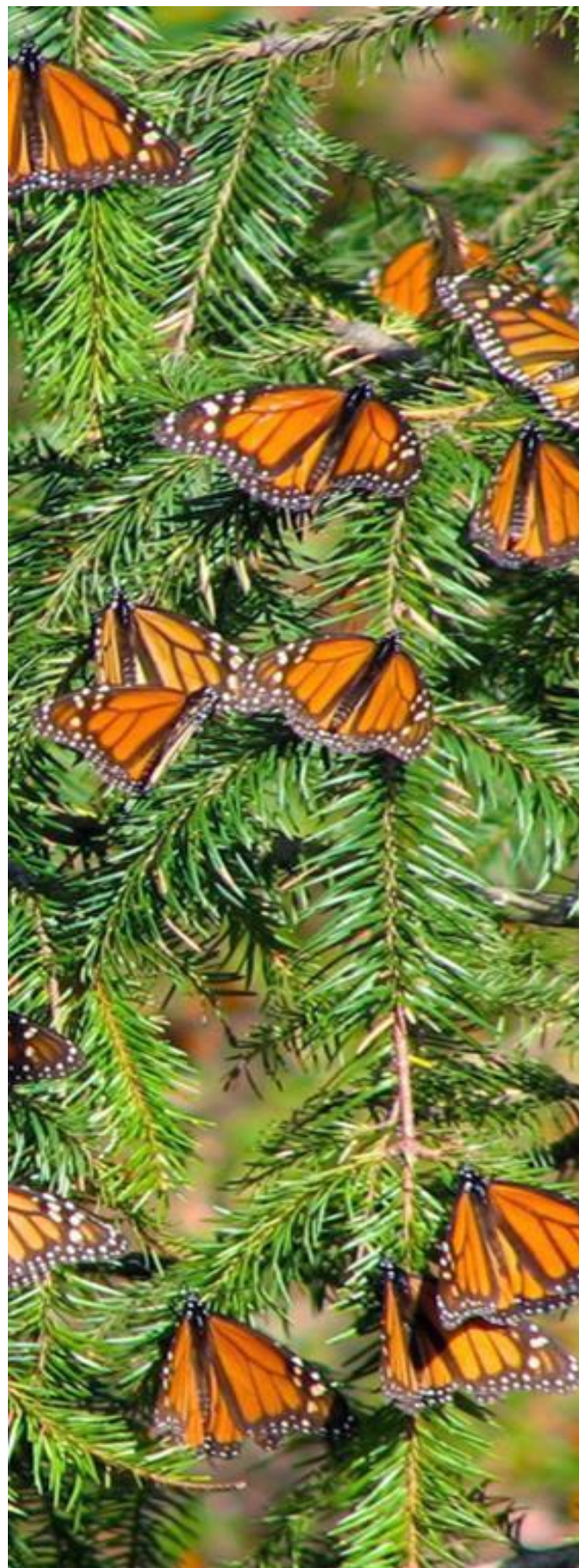
Monarch butterflies basking in the sun.

NSF evaluators and collaborators shall follow NSF procedures to identify and prevent conflicts of interest, and engage in peer review and quality control processes at appropriate stages of the life cycle of an evaluation.