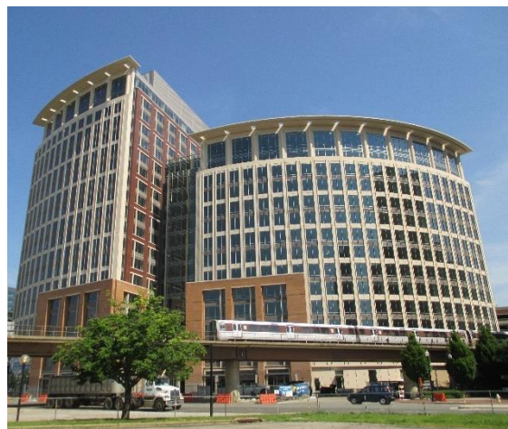
National Science Foundation Headquarters.

NSF is committed to evaluating the efficacy and efficiency of its strategy, leveraging evaluation to help the agency achieve its mission.