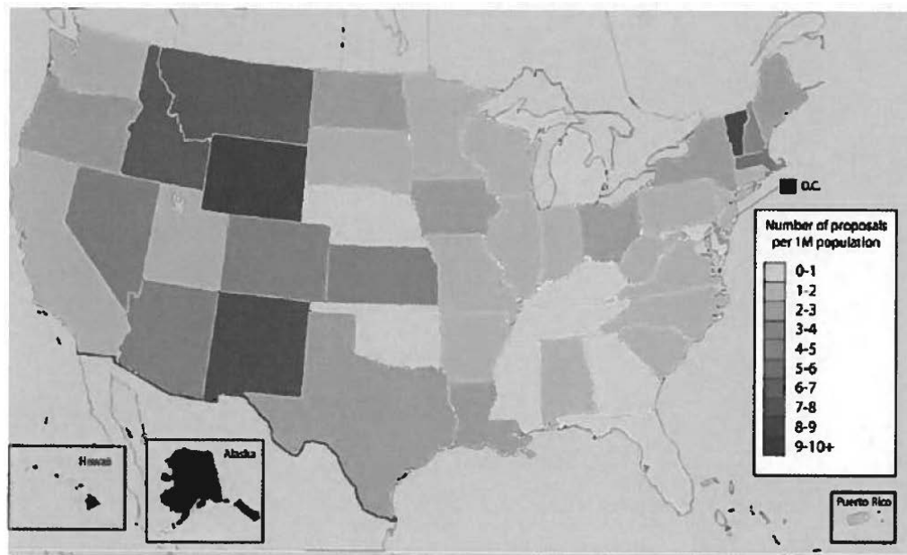
Proposals and Awards by State

Appropriate, though 20% of states (all EPSCoRE) received no funding from the IF program during the review period.