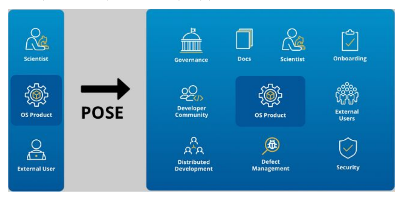
Figure 1. Transition from Open-source Product to Open-source Ecosystem

As shown in Figure 1, the transition from open-source product to OSE can be conceived as a continuum. At one end of this continuum is an early stage open-source artifact that, for example, may have been developed by a scientist for a specific use and has been adopted by a small number of users. At the other end is a fully developed OSE based on a robust open-source artifact, managed by an organization that: coordinates an external distributed developer community; interfaces with and supports a community of users; provides training and on-boarding to new developers and users; enables efficient continuous development, integration, and deployment of the open-source product; maintains an efficient supply chain; ensures security, privacy, and reliability of all aspects of the OSE operations; maintains appropriate organizational governance practices; and attracts resources for the long-term sustenance of the ecosystem. POSE aims to support this transition, assisting the evolution of an early stage open-source project to a fully operational OSE that can realize the potential societal impact nascent in the originating open-source artifact.